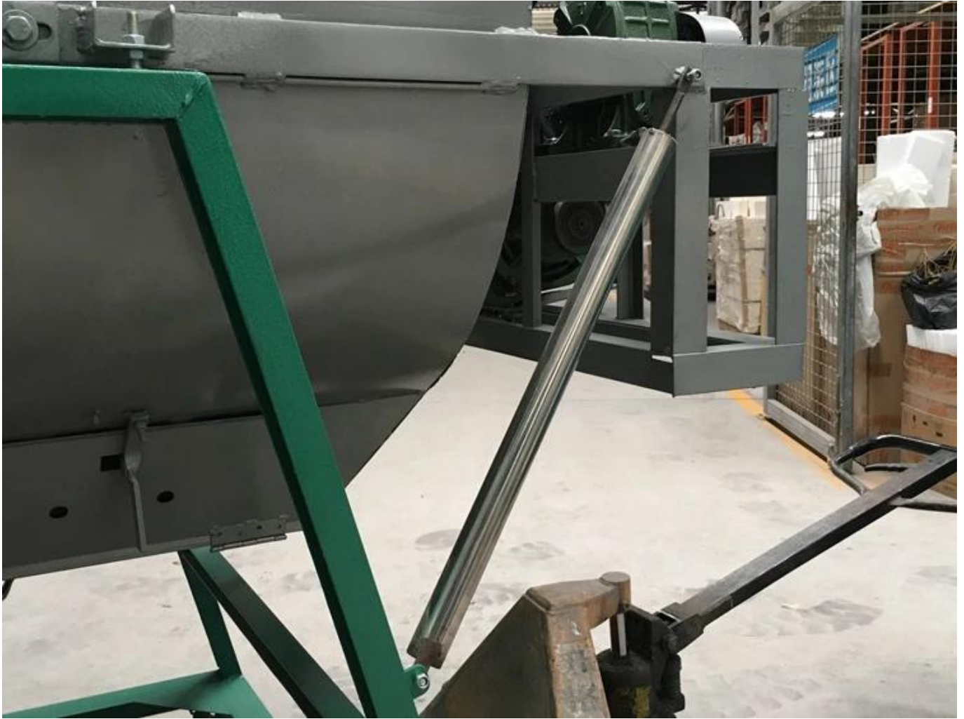
Pneumatic shock absorber design, the machine automatically falls back, and the falling speed is stable.