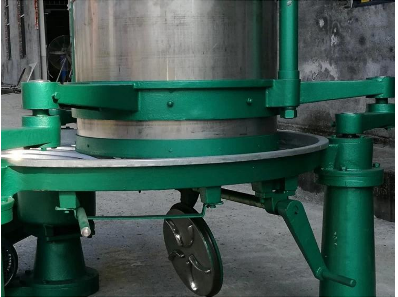
The supporting part of the machine is made of cast iron, which is strong and durable.