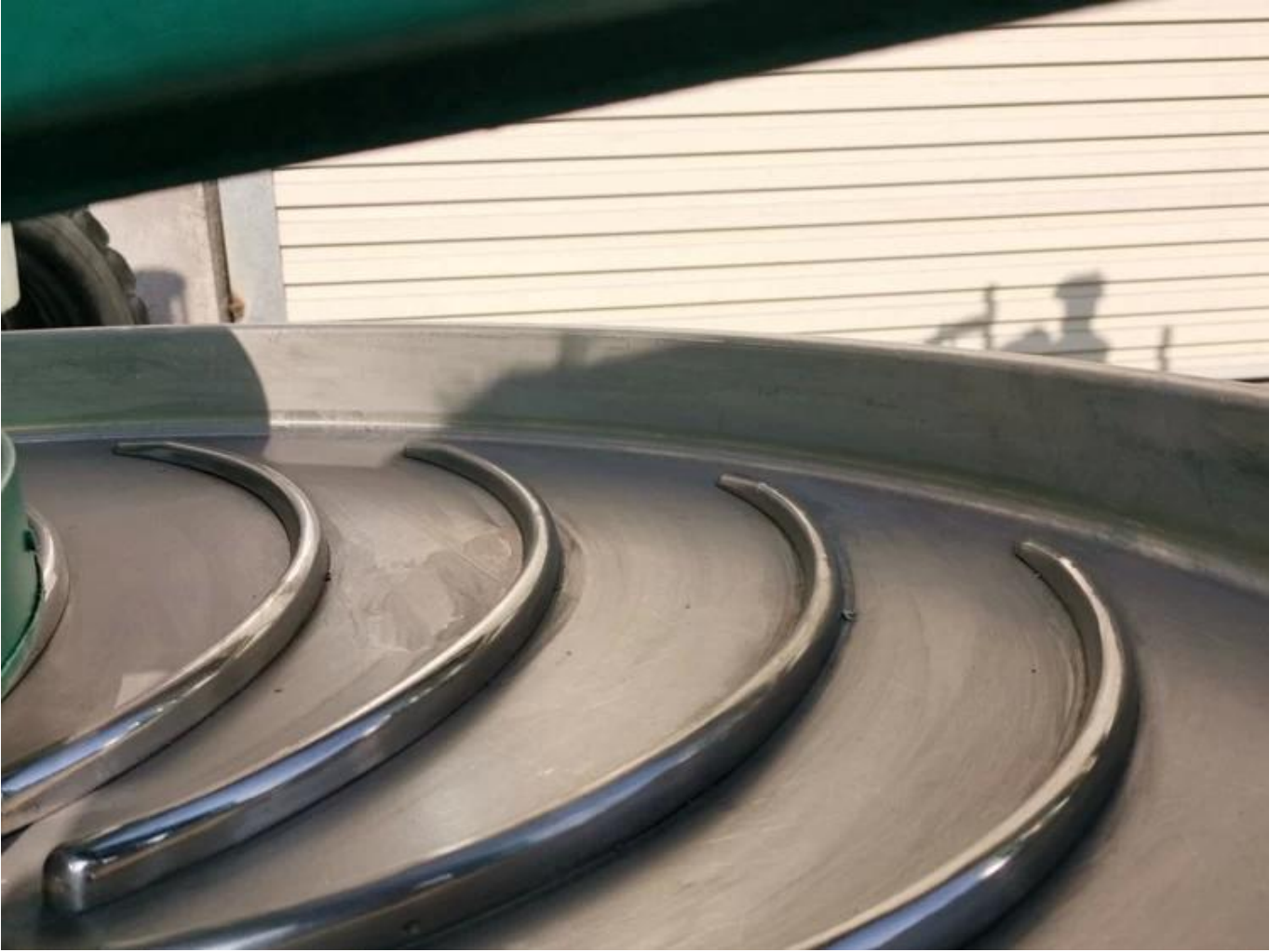
The heightened design of the rolling barrel can prevent the tea leaves from falling.