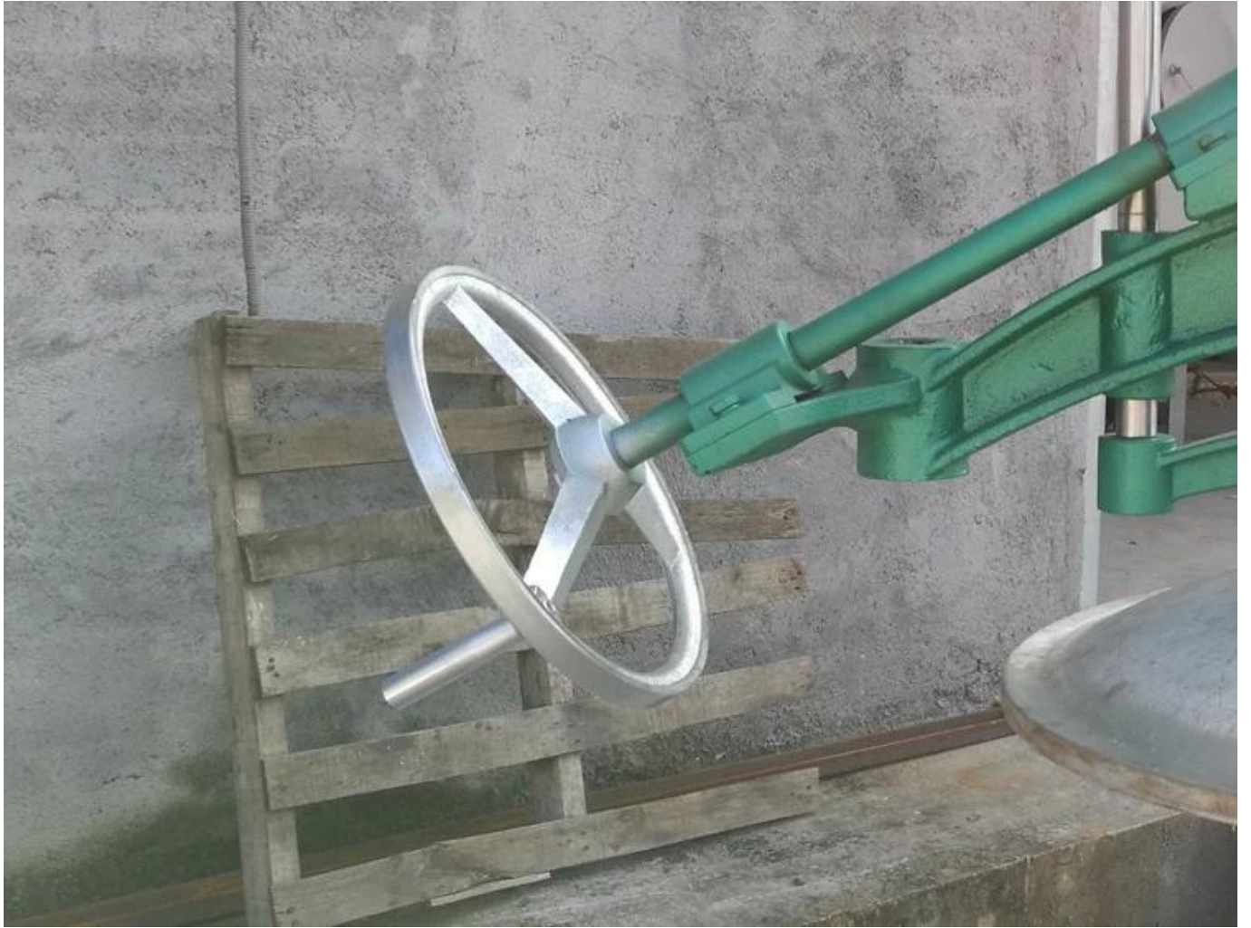
Enlarged handwheel design, faster lifting of the barrel cover.