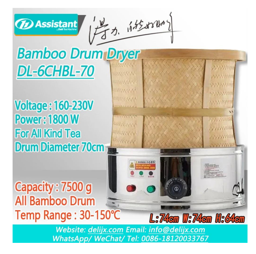
Bamboo Drum Manual Tea Baking Drying Machine DL-6CHBL-70

We recommend use 1 set DL-6CHBL-70 Tea Drying Drum, capacity 7.5kg per batch, for 6.5kg tea leaf need 1 set, working time about 1 hours.