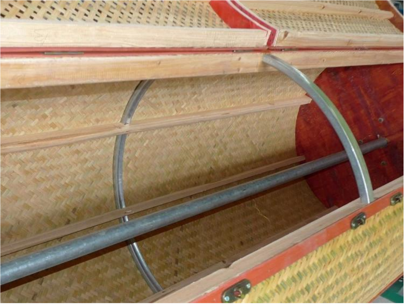
Steel tube and steel ring reinforcement design, the machine runs smoothly, and the body vibration is small.