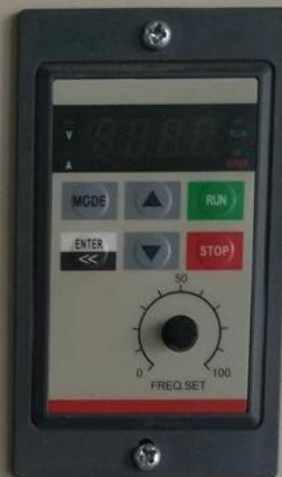
调速器 Speed Control